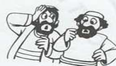
PETER AND JOHN

3. I ran to tell Peter that I didn't know where Jesus' body was.