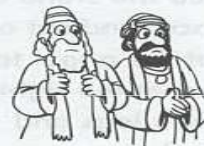
JOSEPH AND NICODEMUS

1. Early Sunday morning, I came to the tomb and saw that the stone had been moved.